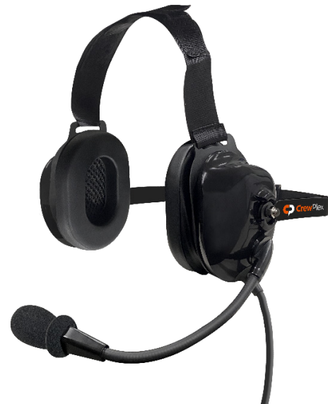
CHS-HH210R-DMG Hard Hat Headset

CrewPlex, LLC 205 Technology Parkway Auburn, Alabama 36830 USA www.crewplex.com Phone +1.334.321.1400 Toll-Free 1.800.279.7539 Fax +1.334.321.1162