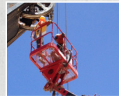
HYDRAULIC WORK PLATFORM

Visit www.elliottequip.com to find a distributor in your area for pricing, availability, rentals, financing and more. Contact Elliott directly at sales@elliottequip.com or (402) 592-4500.