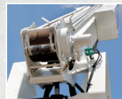
HI REACH BOOM WINCH