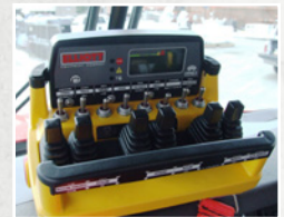
WIRELESS REMOTE CONTROLS