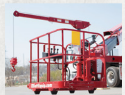
HI REACH JIB WINCH