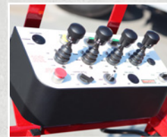
ELLIOTT DYNASMOOTH CONTROLS